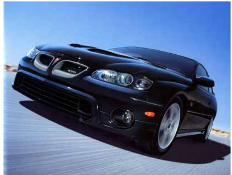
The Appearance Pack from 2006 that provides a far better looking muscle car. Pontiac MD