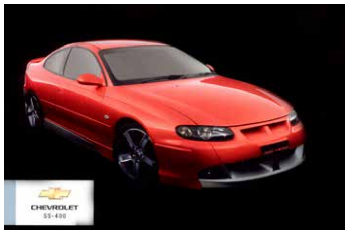
Proposed Holden export LHD Chevrolet SS-400. Would forgetting the Pontiac GTO name badge been a better option? GM Corp.