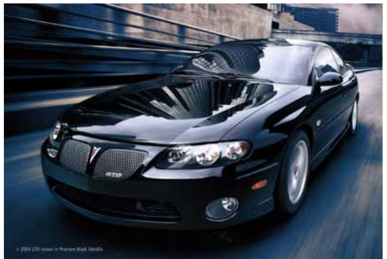
The Pontiac GTO as released in 2004. Image from Brochure. Pontiac MD