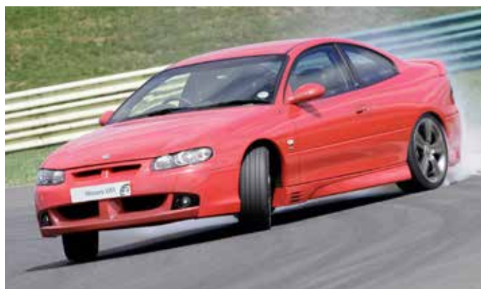
The Vauxhall VRX, based on HSV’s Coupe. Would this have made a better Pontiac GTO?