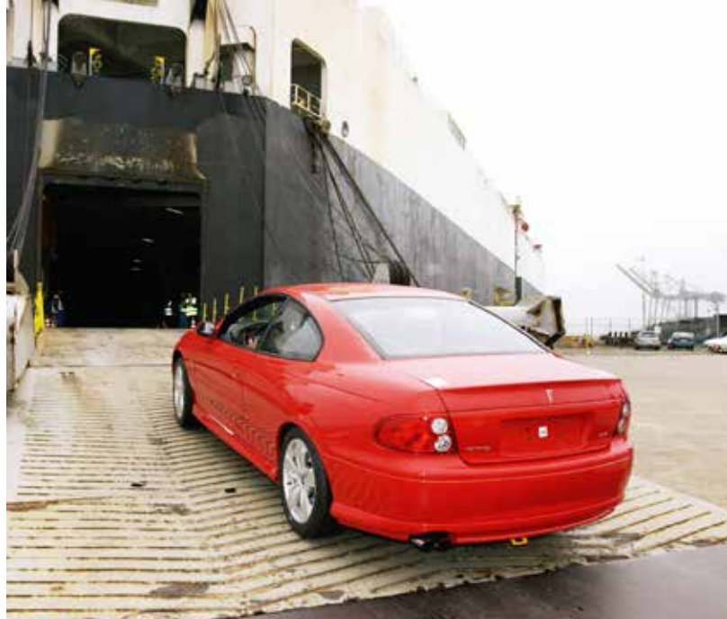
The first shipment of Pontiac GTOs is loaded.

“Pontiac’s new Australian-sourced GTO brings lusty, affordable performance while disguised as a phone-company